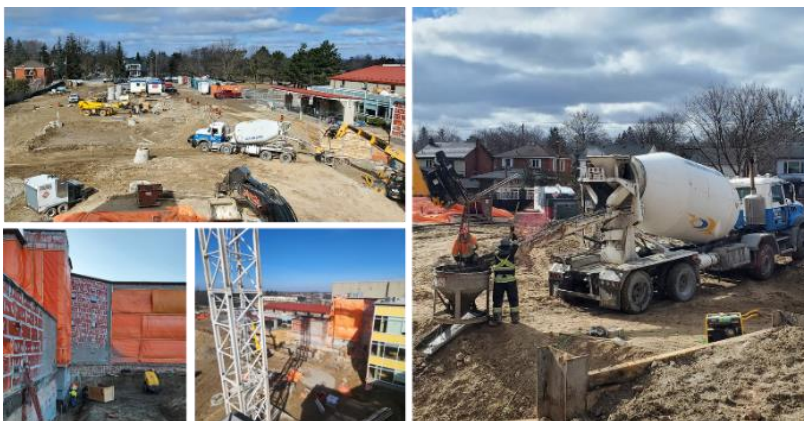
peopleCare AR Goudie LTC 128-bed expansion.

Read the latest on all peopleCare's Developments .