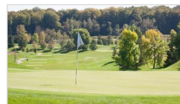
Rebel Creek Golf Course