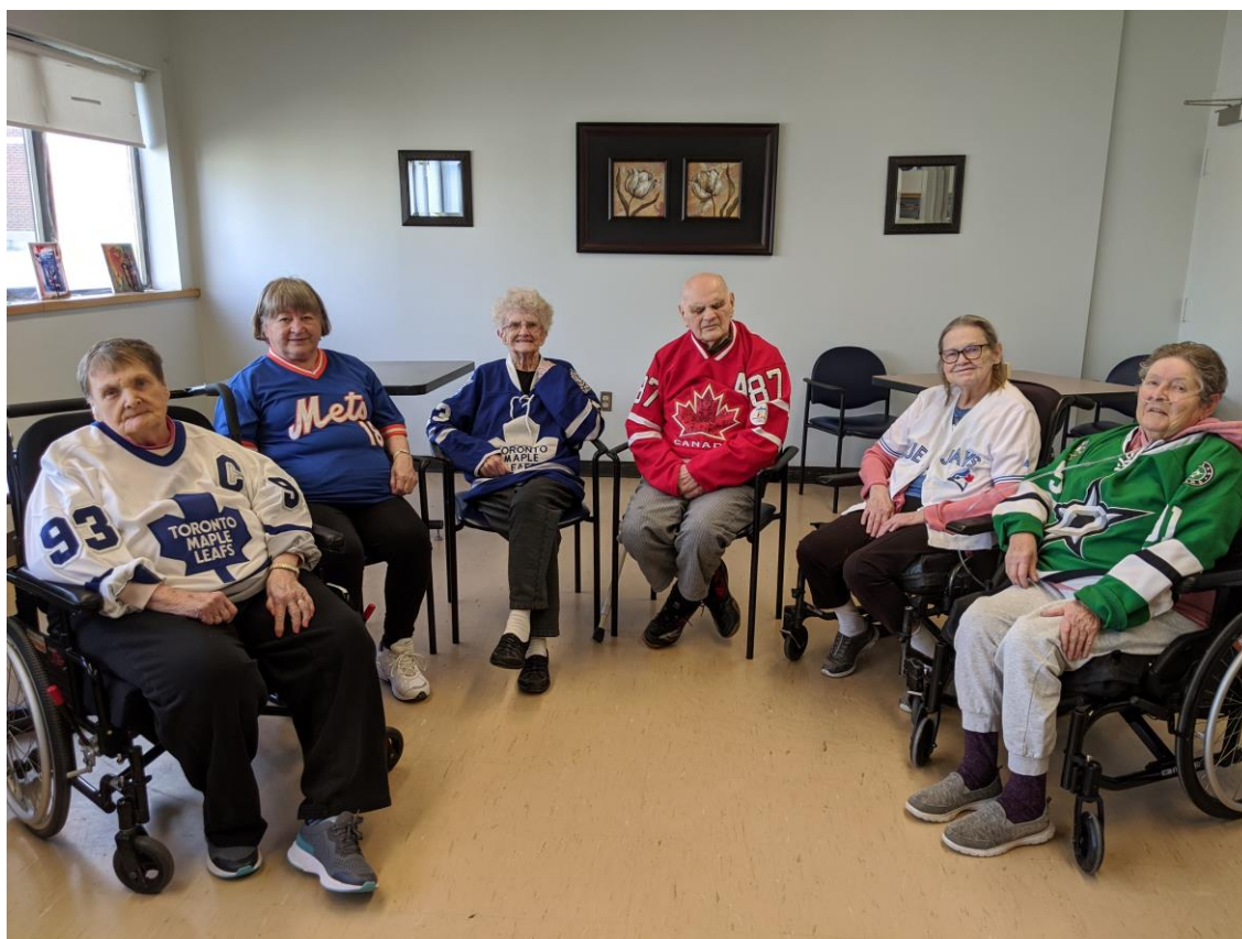
Residents at Delhi LTC take part in a spirit day; Jersey Day!

Residents Councils' play an important role in shaping the place residents call home. They bring residents together as peers, to discuss issues of importance and to stay connected and engaged in home operations and decision-making.